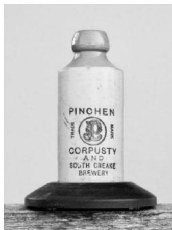
The "PINCHEN POT" Found in the mud at Cley

The objective is to travel from the east end of Blakeney Quay to the North end of Cley Quay on a single tide and record your fastest time!