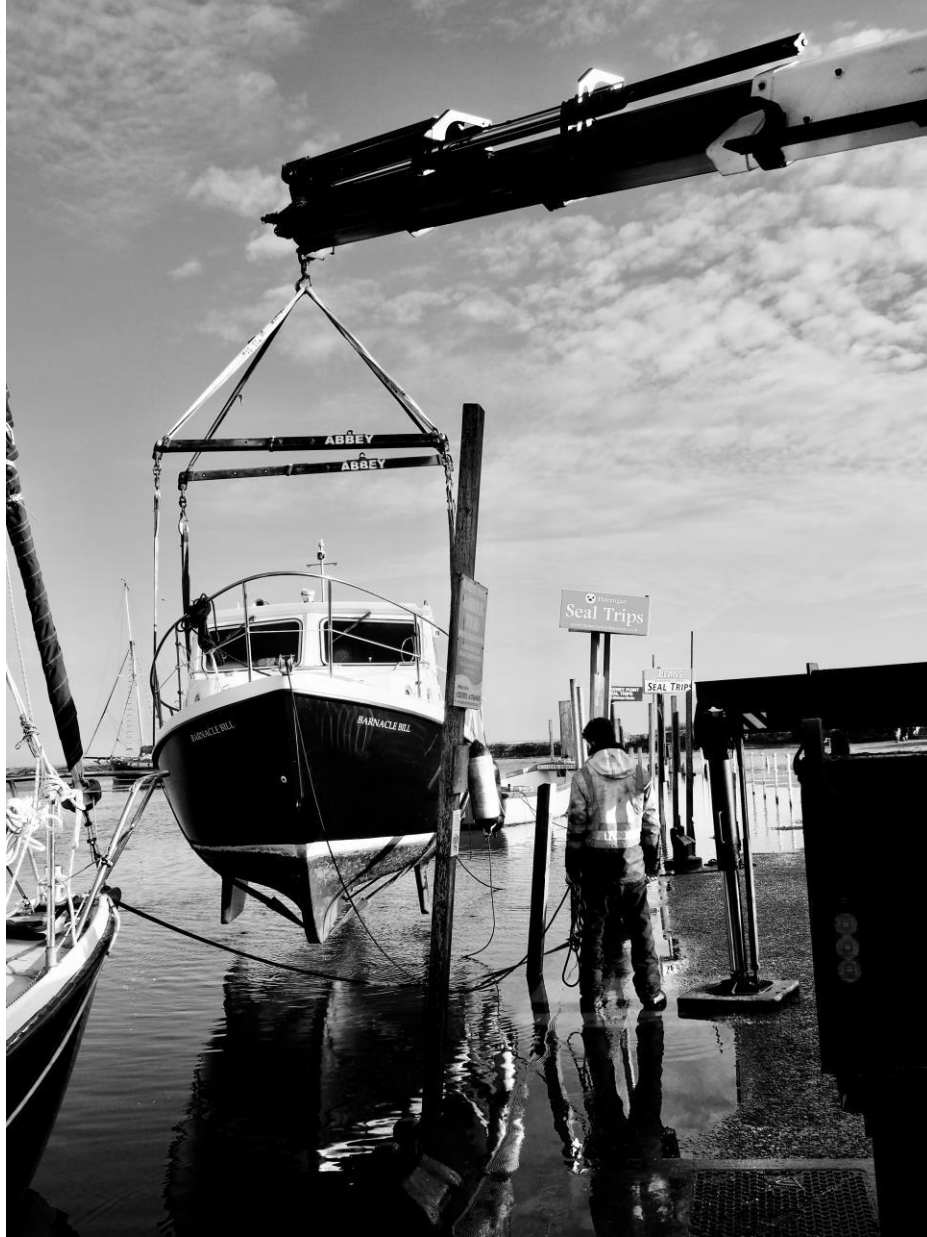
'No crabbers, but still busy in Winter on Blakeney Quay'