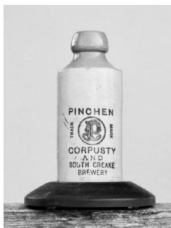
The "PINCHEN POT" Found in the mud at Cley

The objective is to travel from the east end of Blakeney Quay to the North end of Cley Quay on a single tide and record your fastest time!