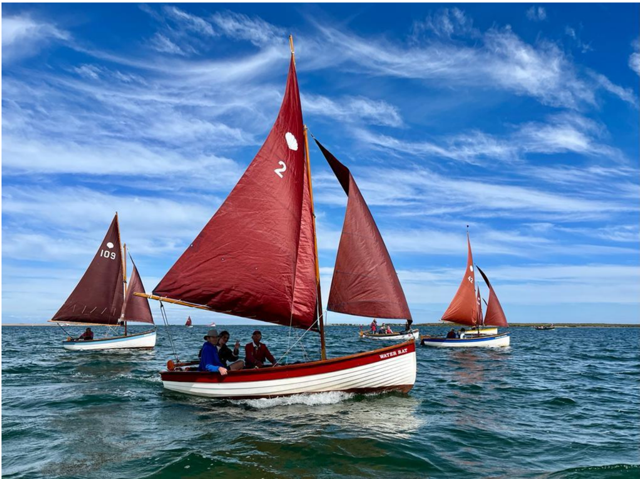
Robin's Cockle no2 Water Rat